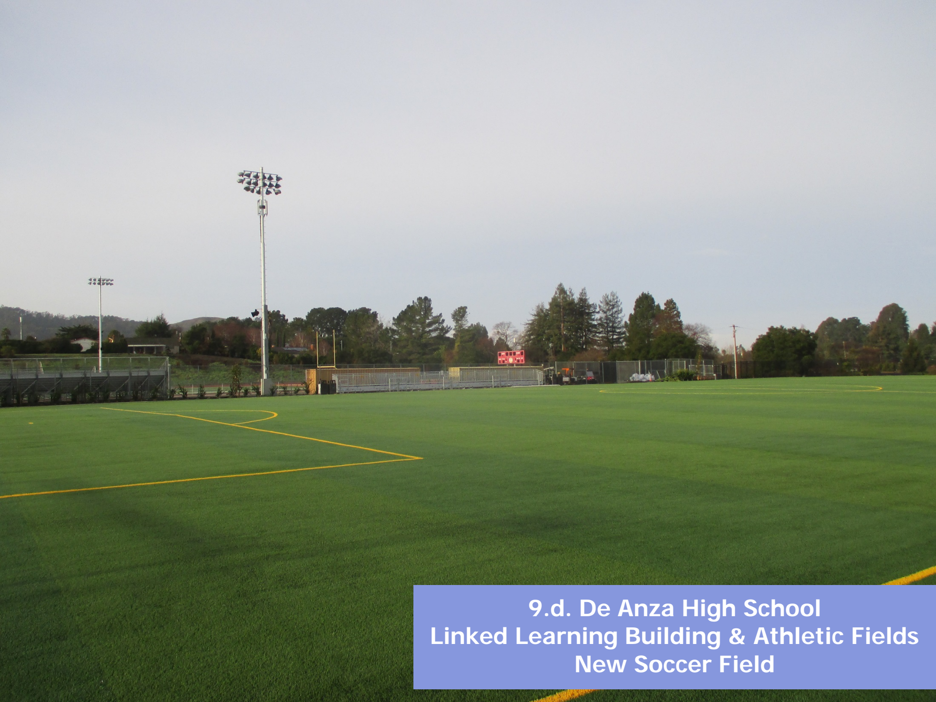
9.d. De Anza High School Linked Learning Building & Athletic Fields New Soccer Field