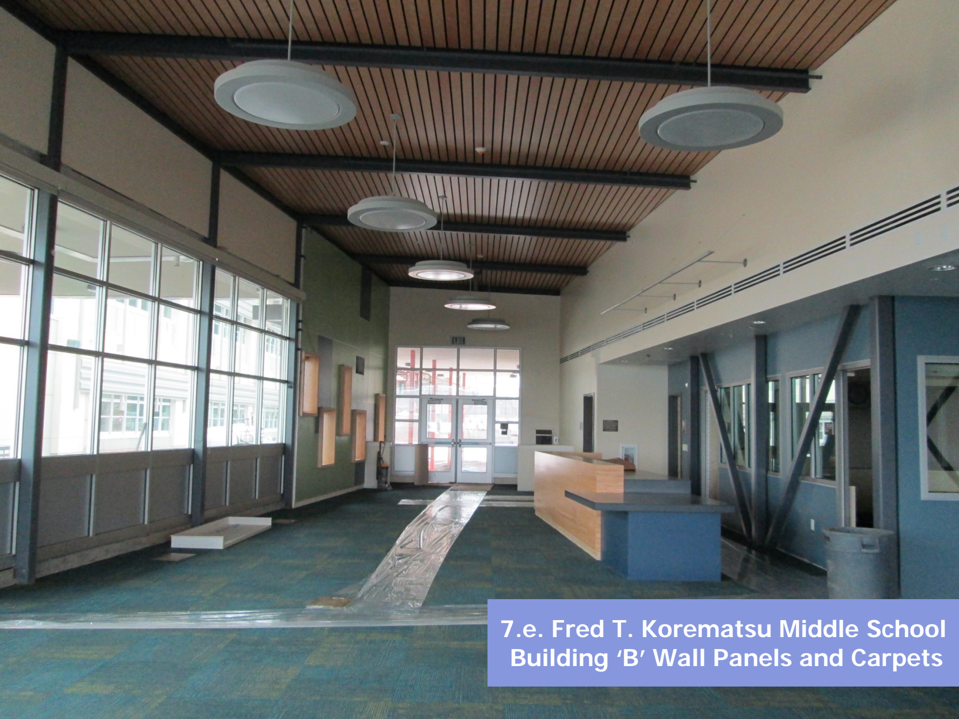
7.e. Fred T. Korematsu Middle School Building 'B' Wall Panels and Carpets