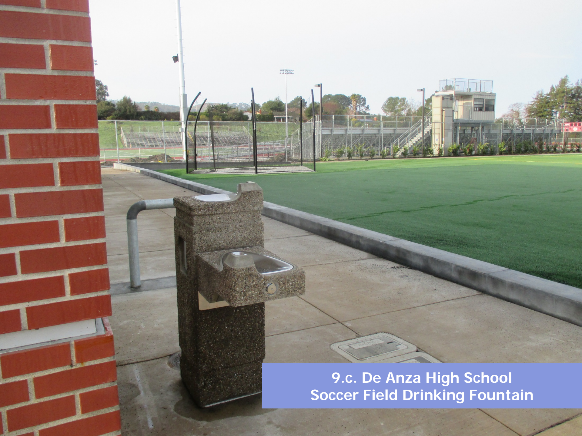
9.c. De Anza High School Soccer Field Drinking Fountain