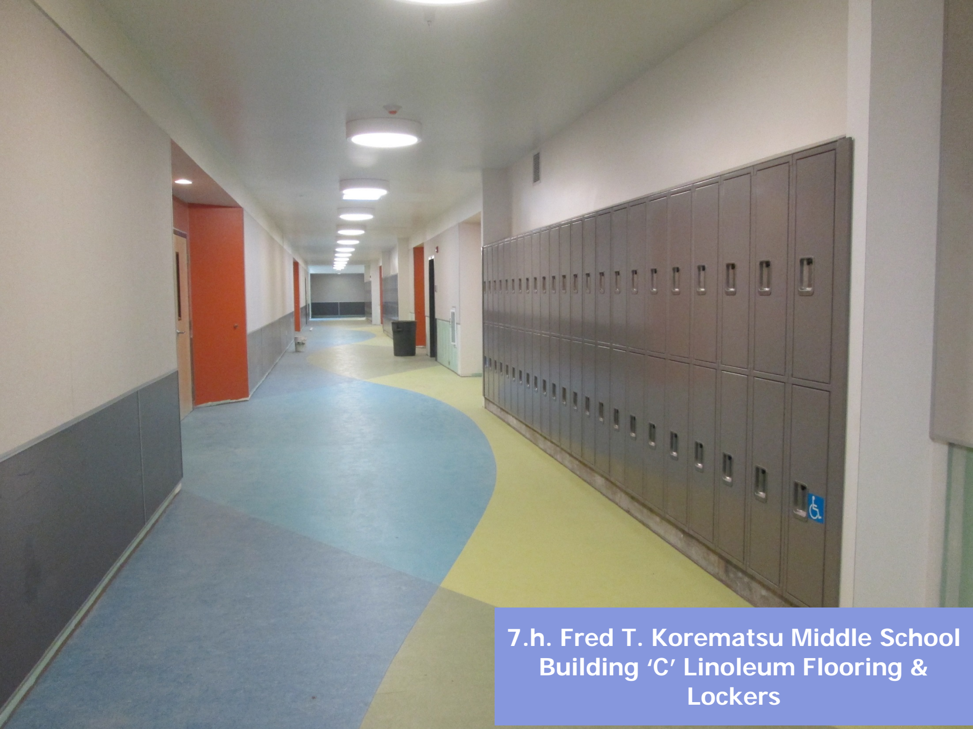
7.h. Fred T. Korematsu Middle School Building 'C' Linoleum Flooring & Lockers