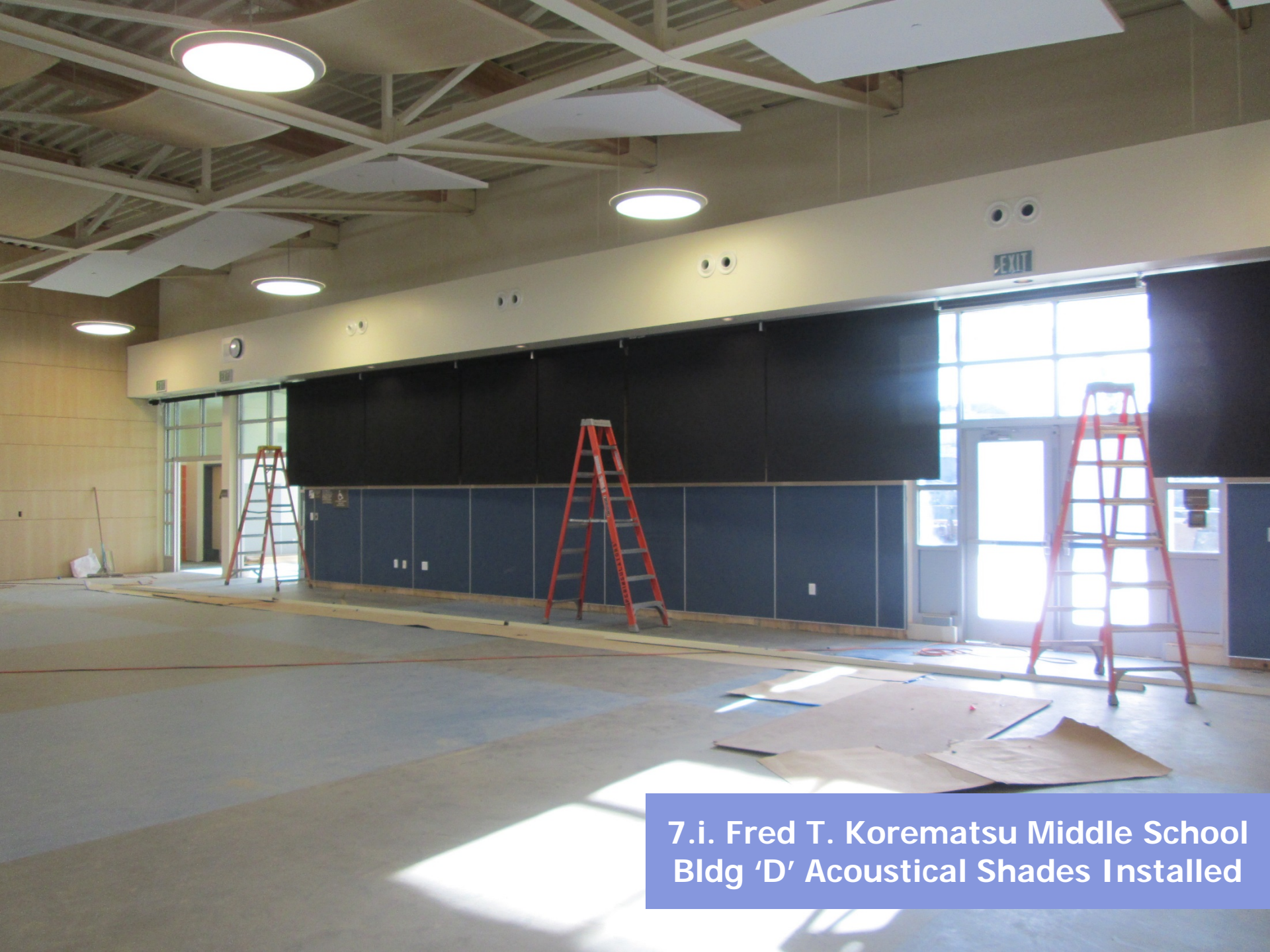
7.i. Fred T. Korematsu Middle School Bldg 'D' Acoustical Shades Installed