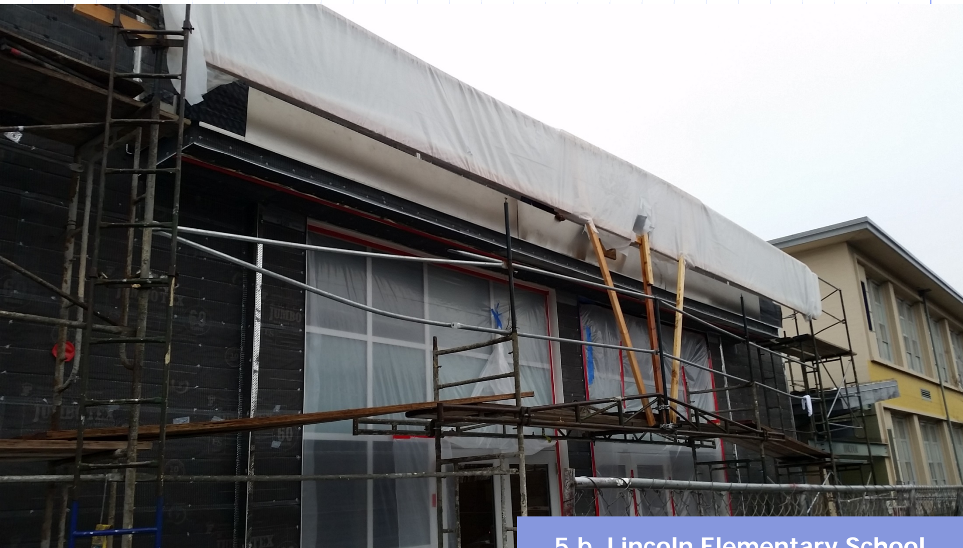
5.b. Lincoln Elementary School Building 'A' Exterior Repairs