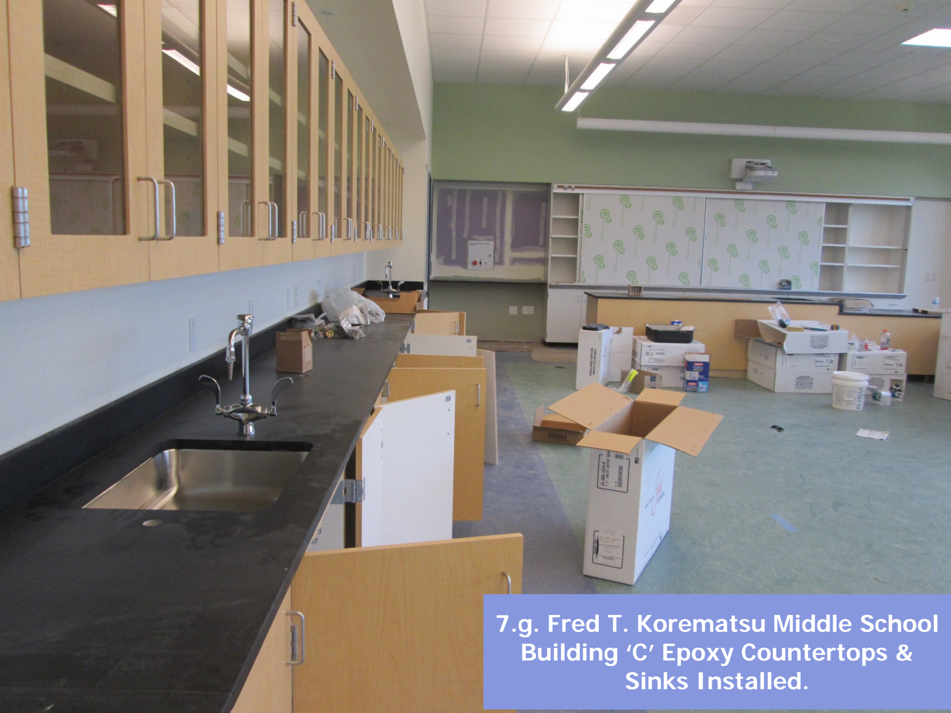
7.g. Fred T. Korematsu Middle School Building 'C' Epoxy Countertops & Sinks Installed.