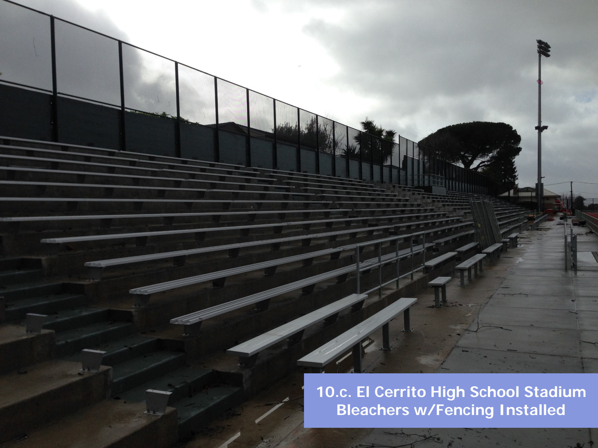
10.c. El Cerrito High School Stadium Bleachers w/Fencing Installed