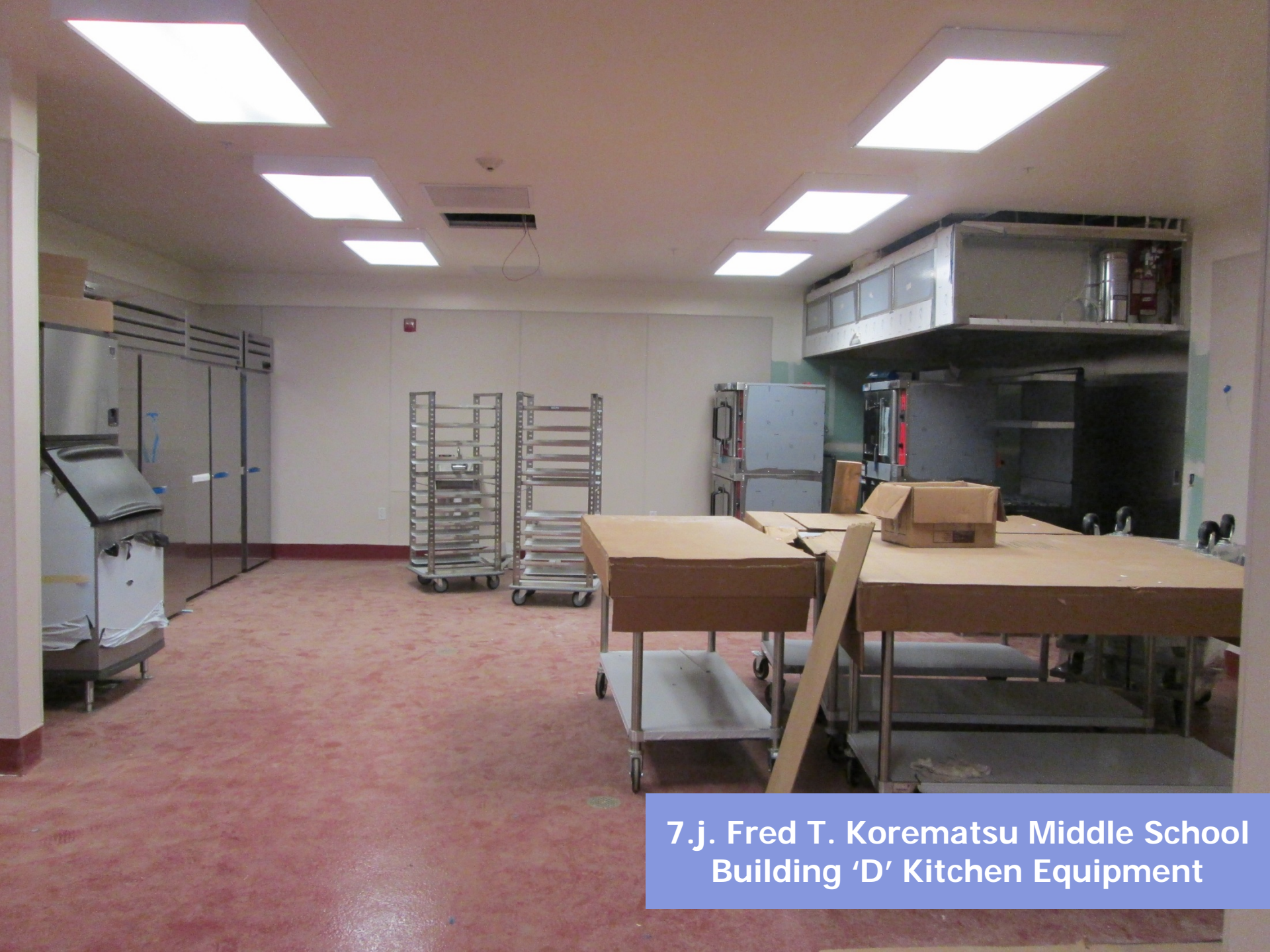
7.j. Fred T. Korematsu Middle School Building 'D' Kitchen Equipment