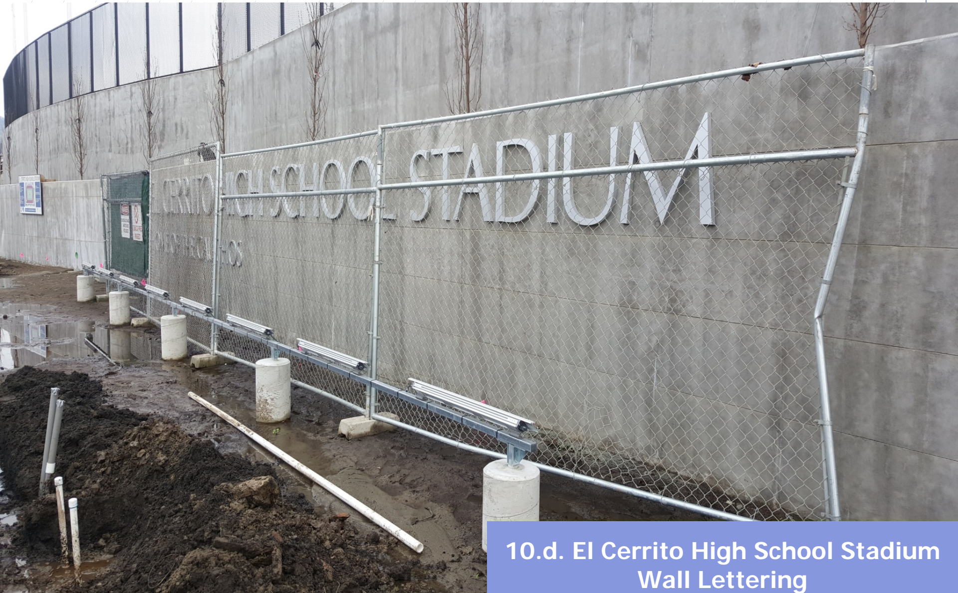
10.d. El Cerrito High School Stadium Wall Lettering