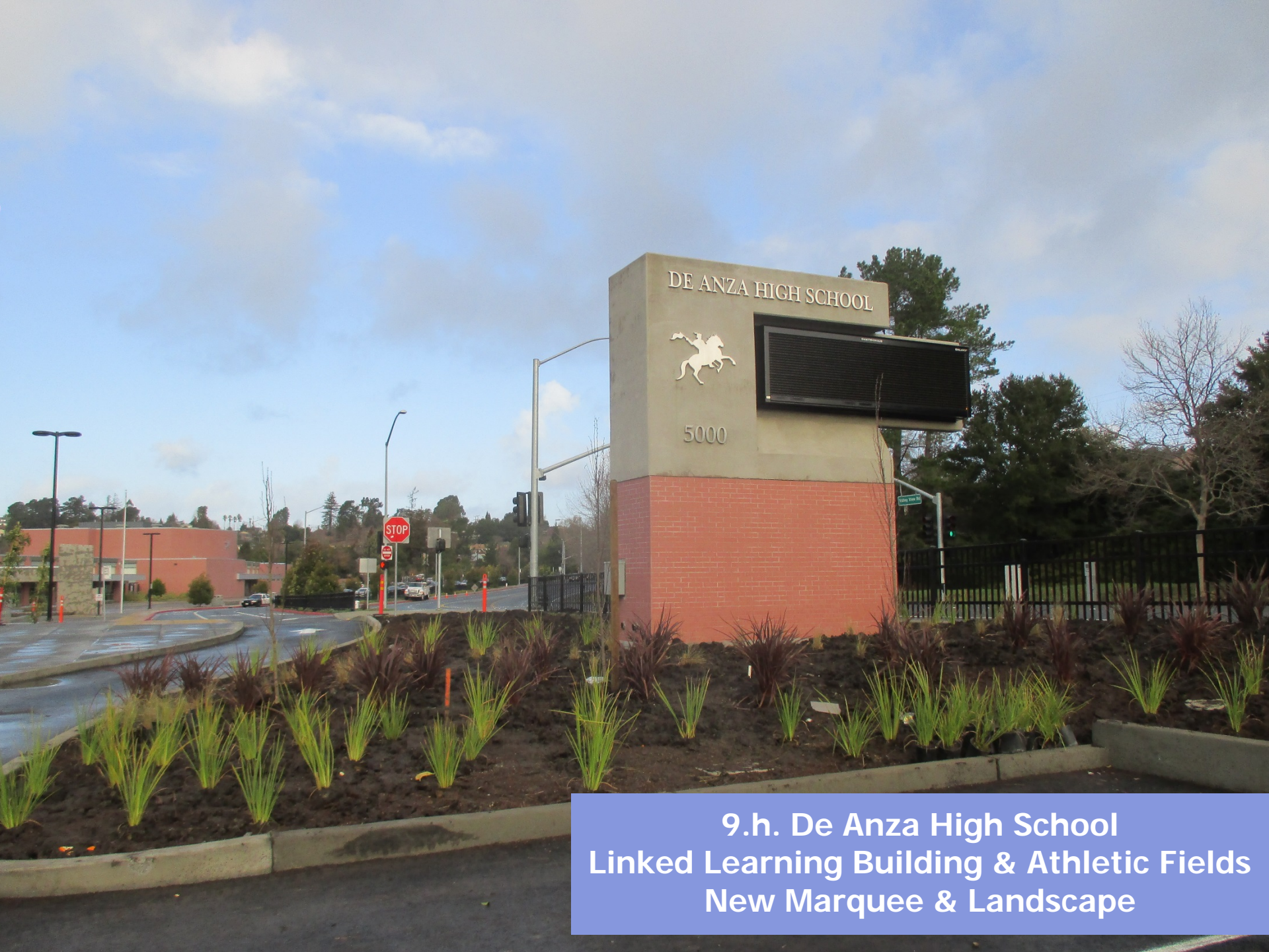
9.h. De Anza High School Linked Learning Building & Athletic Fields New Marquee & Landscape