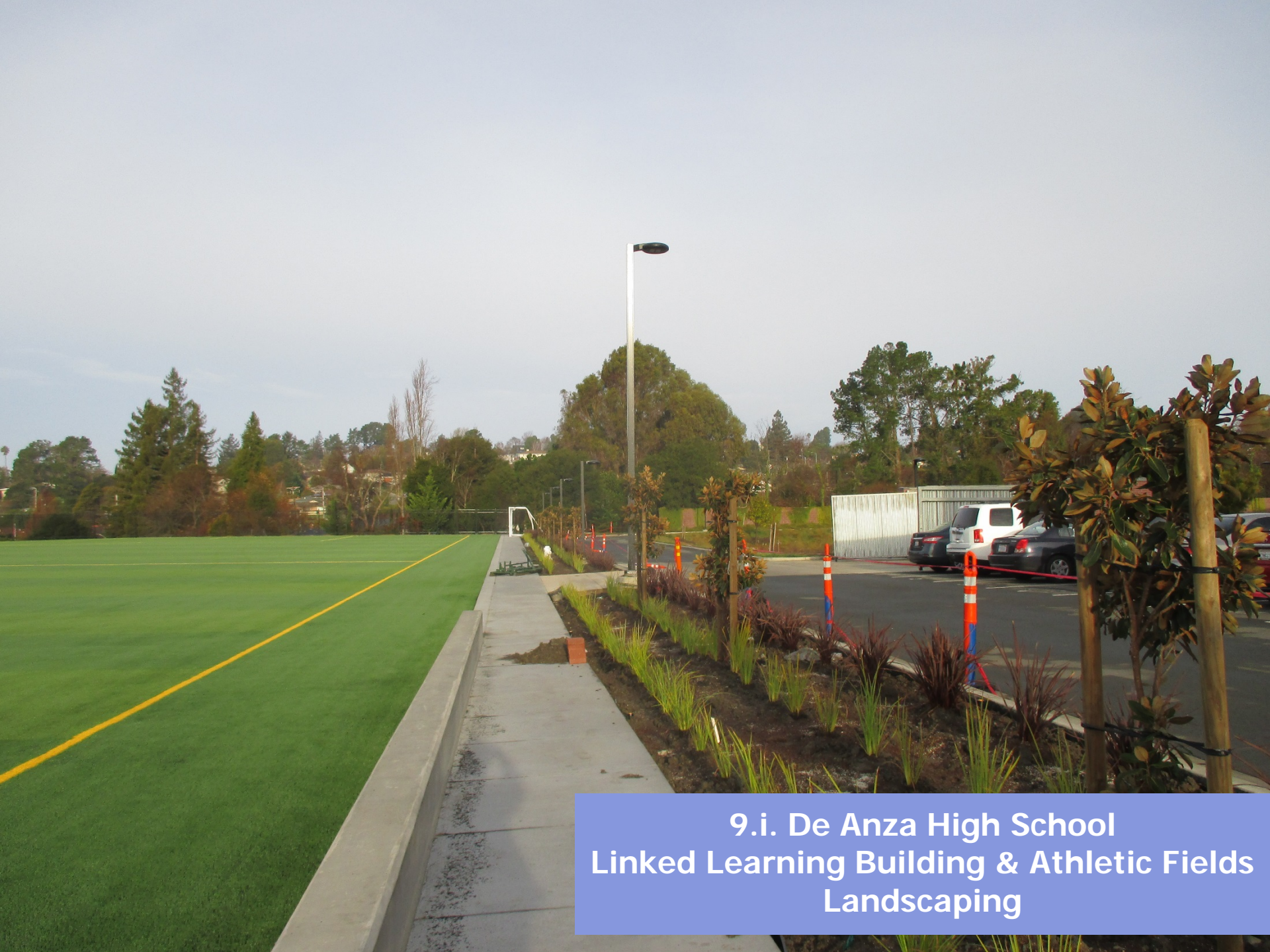
9.i. De Anza High School Linked Learning Building & Athletic Fields Landscaping