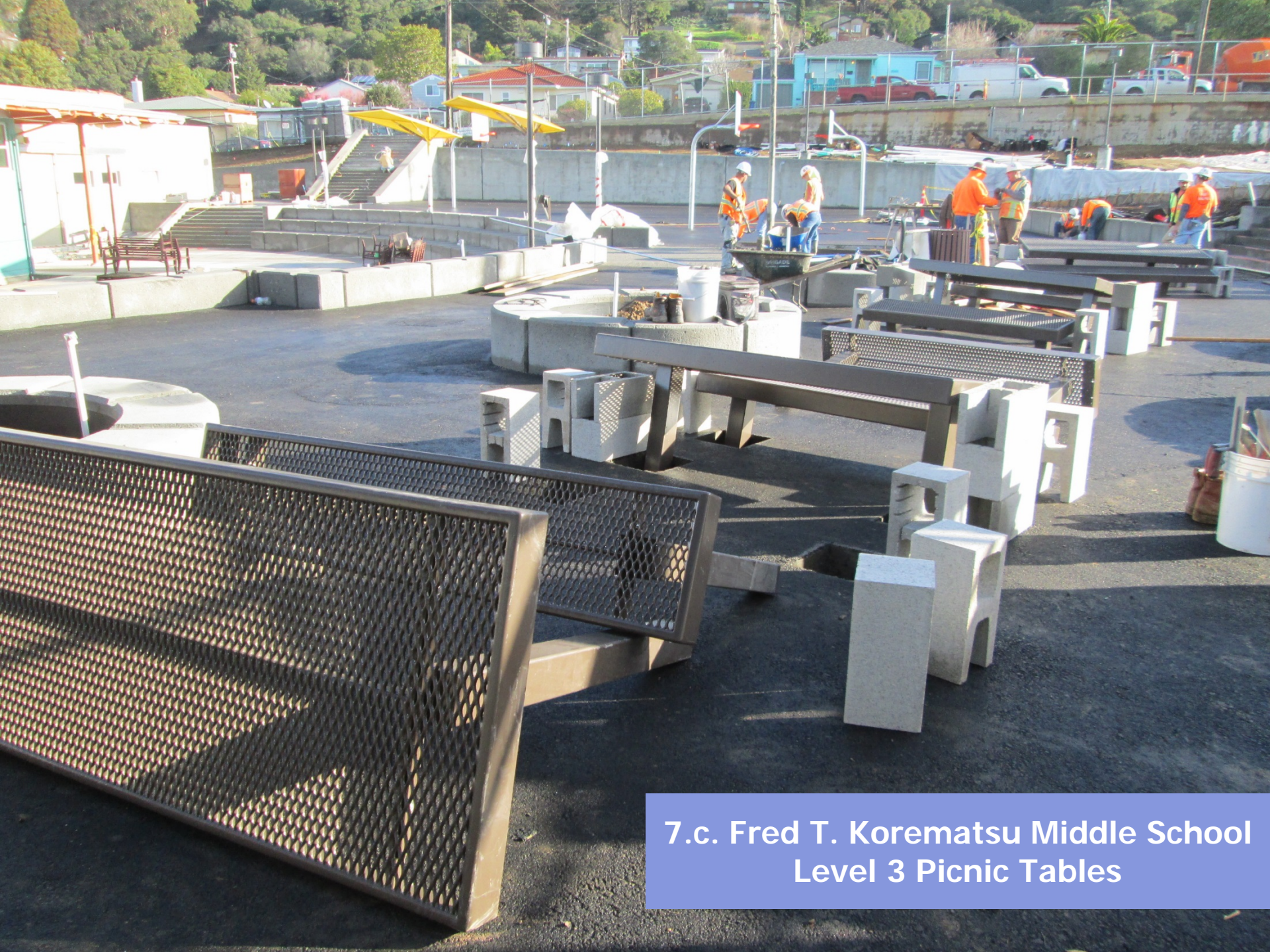
7.c. Fred T. Korematsu Middle School Level 3 Picnic Tables