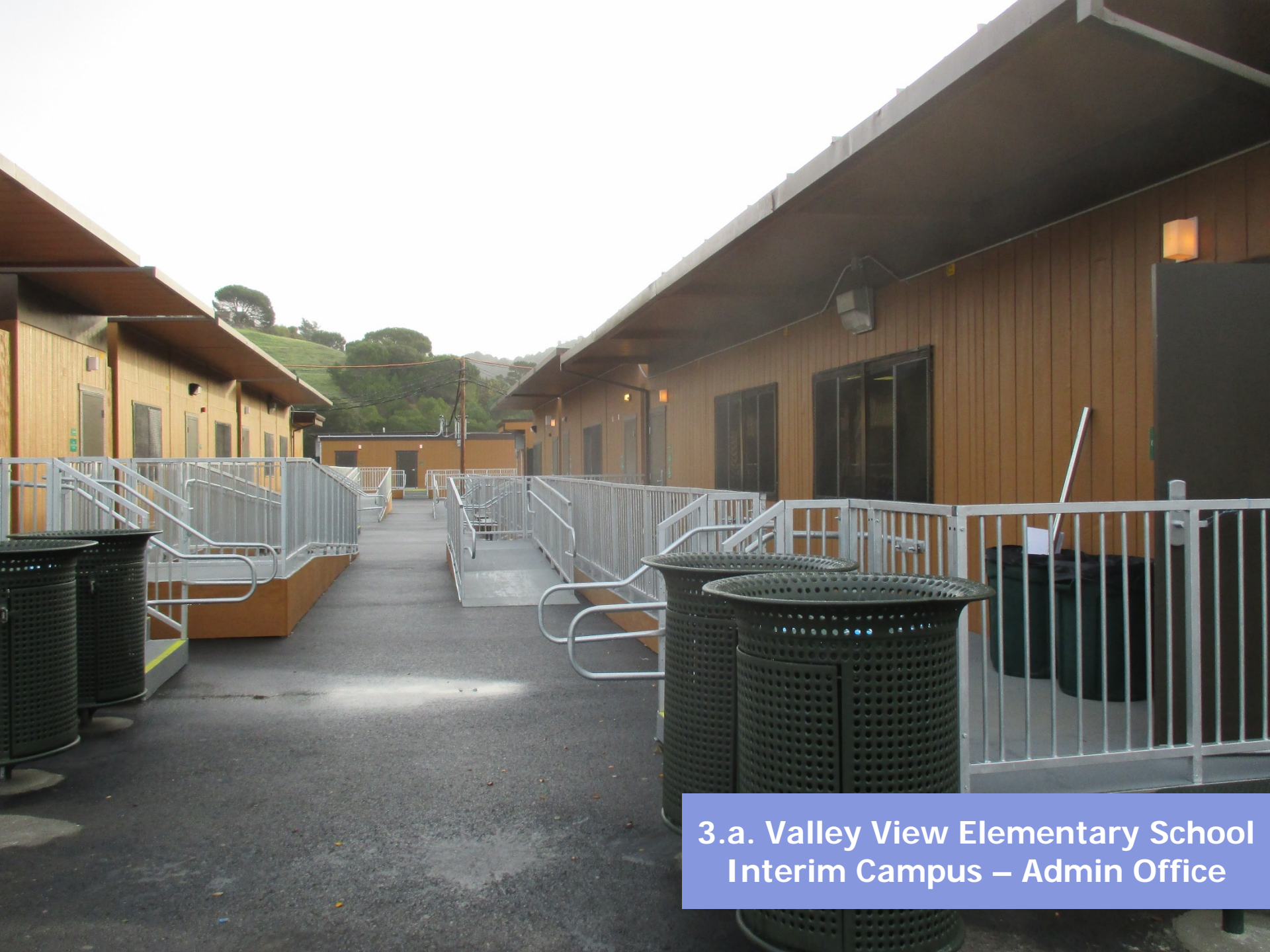
3.a. Valley View Elementary School Interim Campus – Admin Office