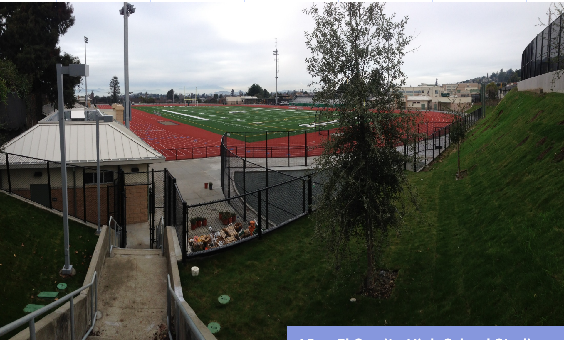
10.a. El Cerrito High School Stadium Project Site