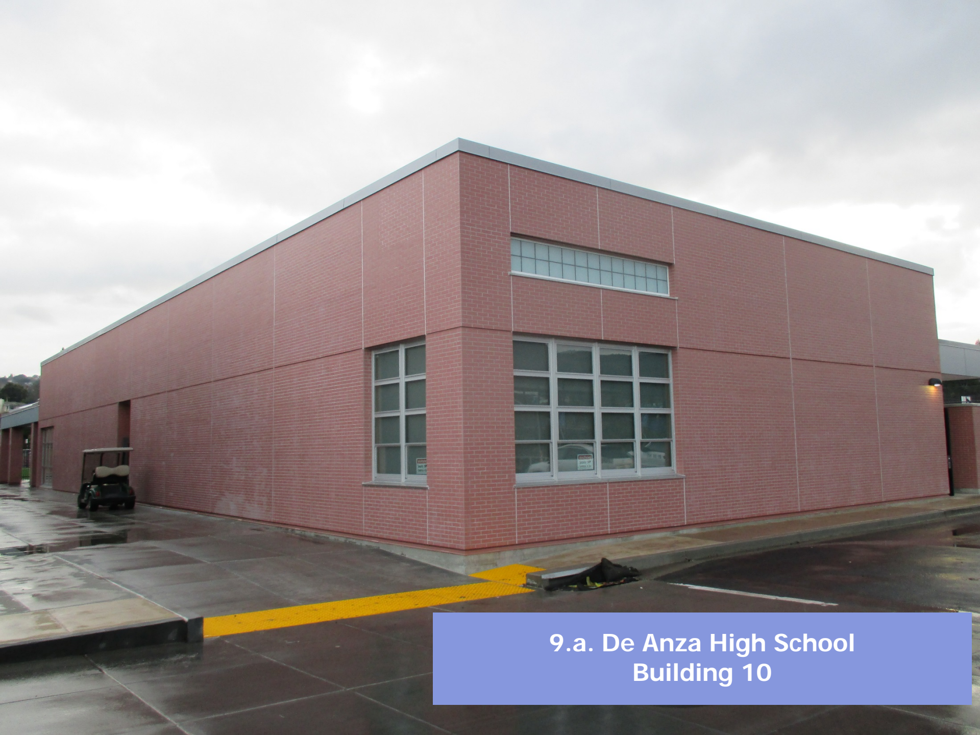
9.a. De Anza High School Building 10