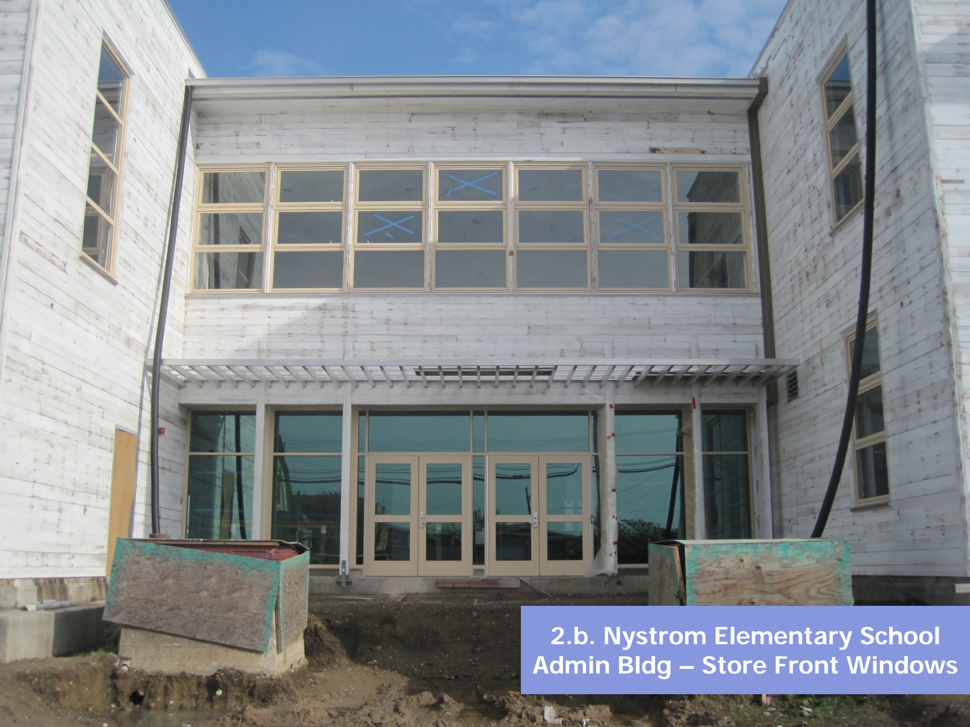
2.b. Nystrom Elementary School Admin Bldg – Store Front Windows