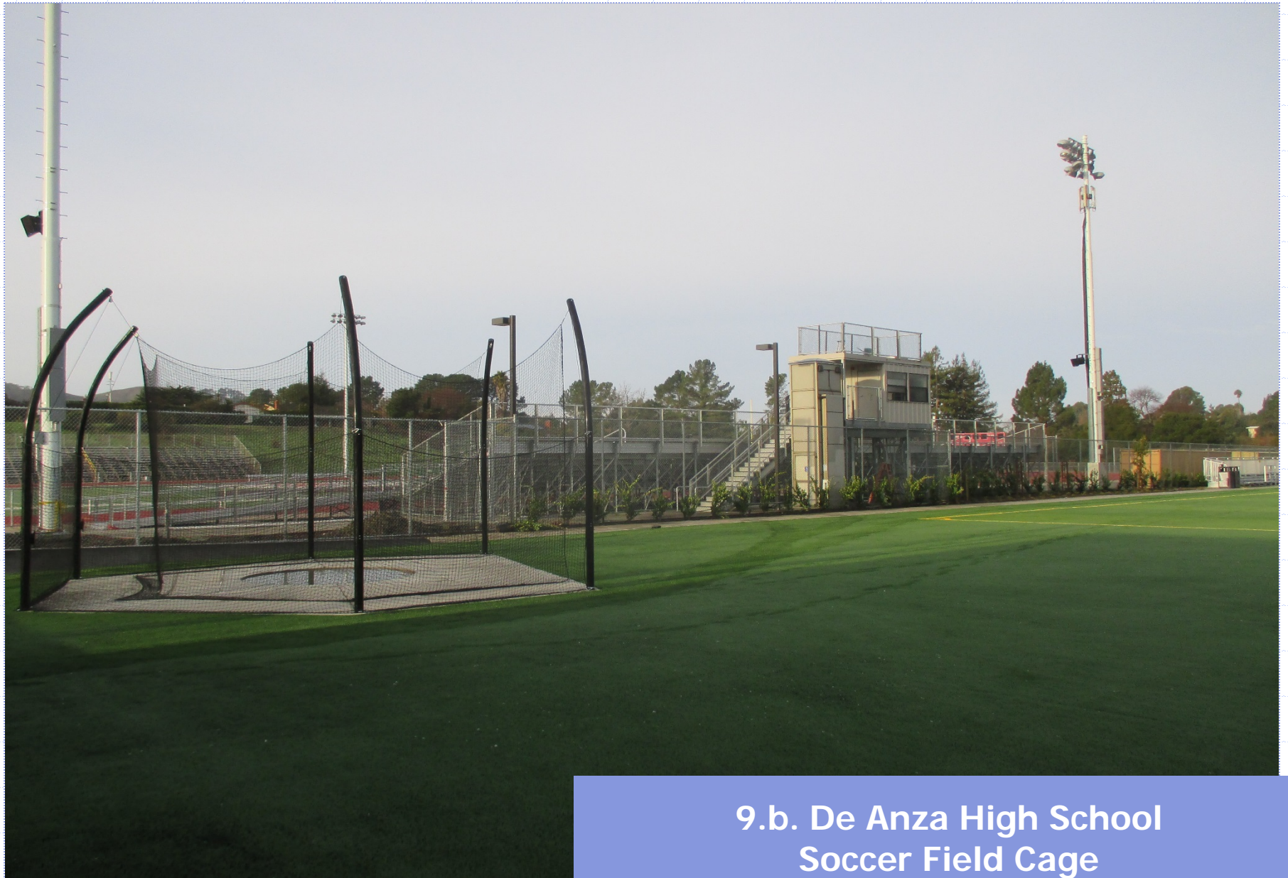
9.b. De Anza High School Soccer Field Cage