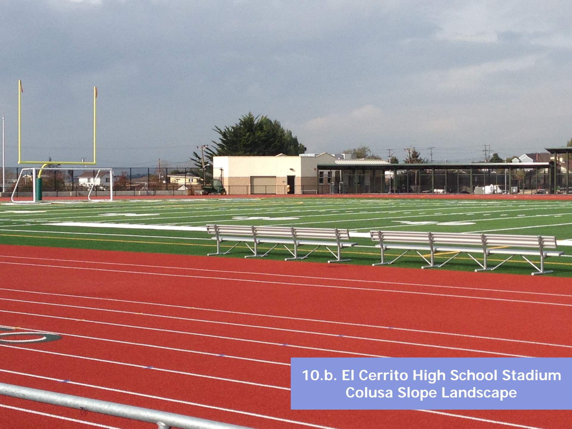
10.b. El Cerrito High School Stadium Colusa Slope Landscape