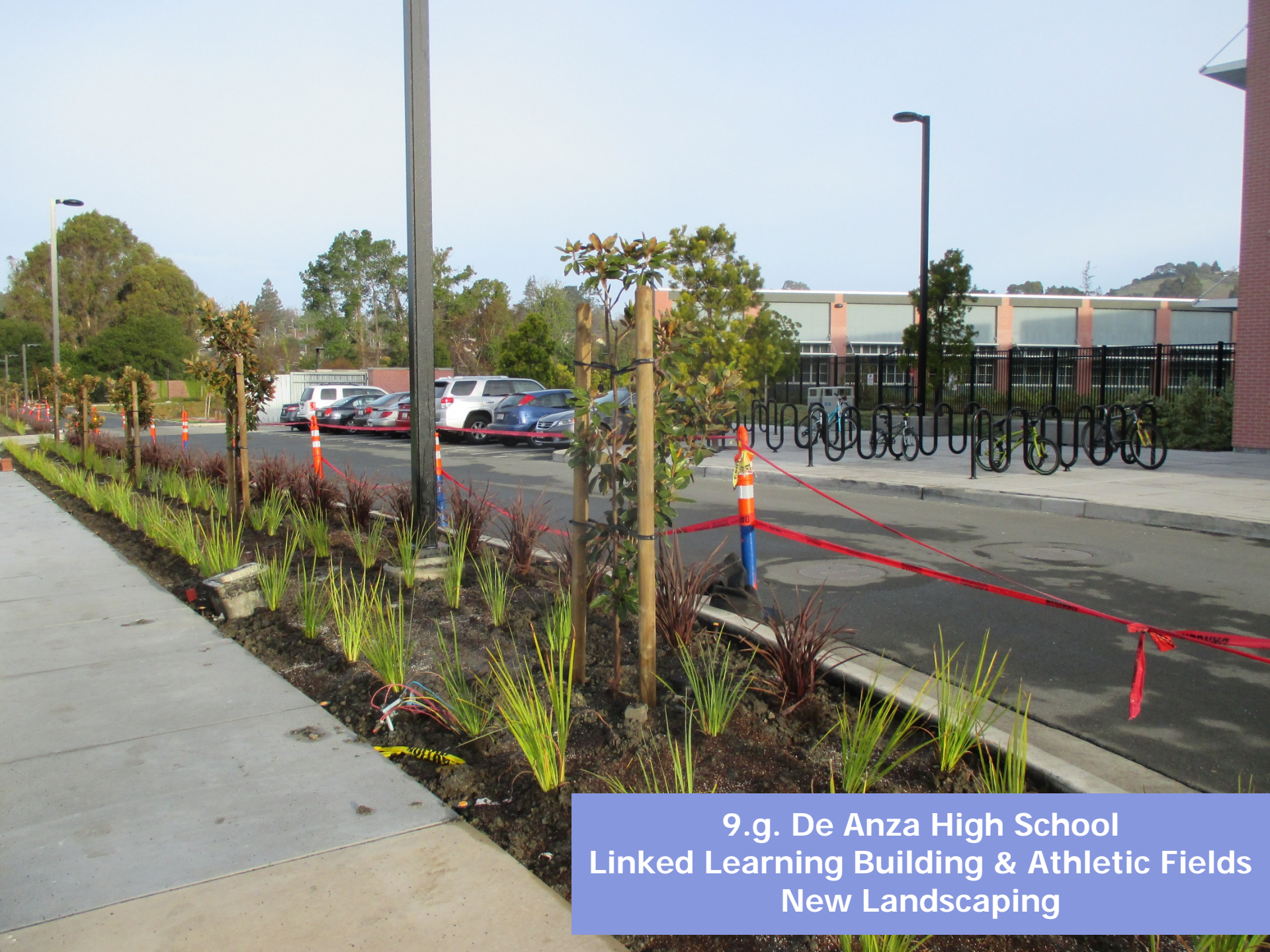
9.g. De Anza High School Linked Learning Building & Athletic Fields New Landscaping