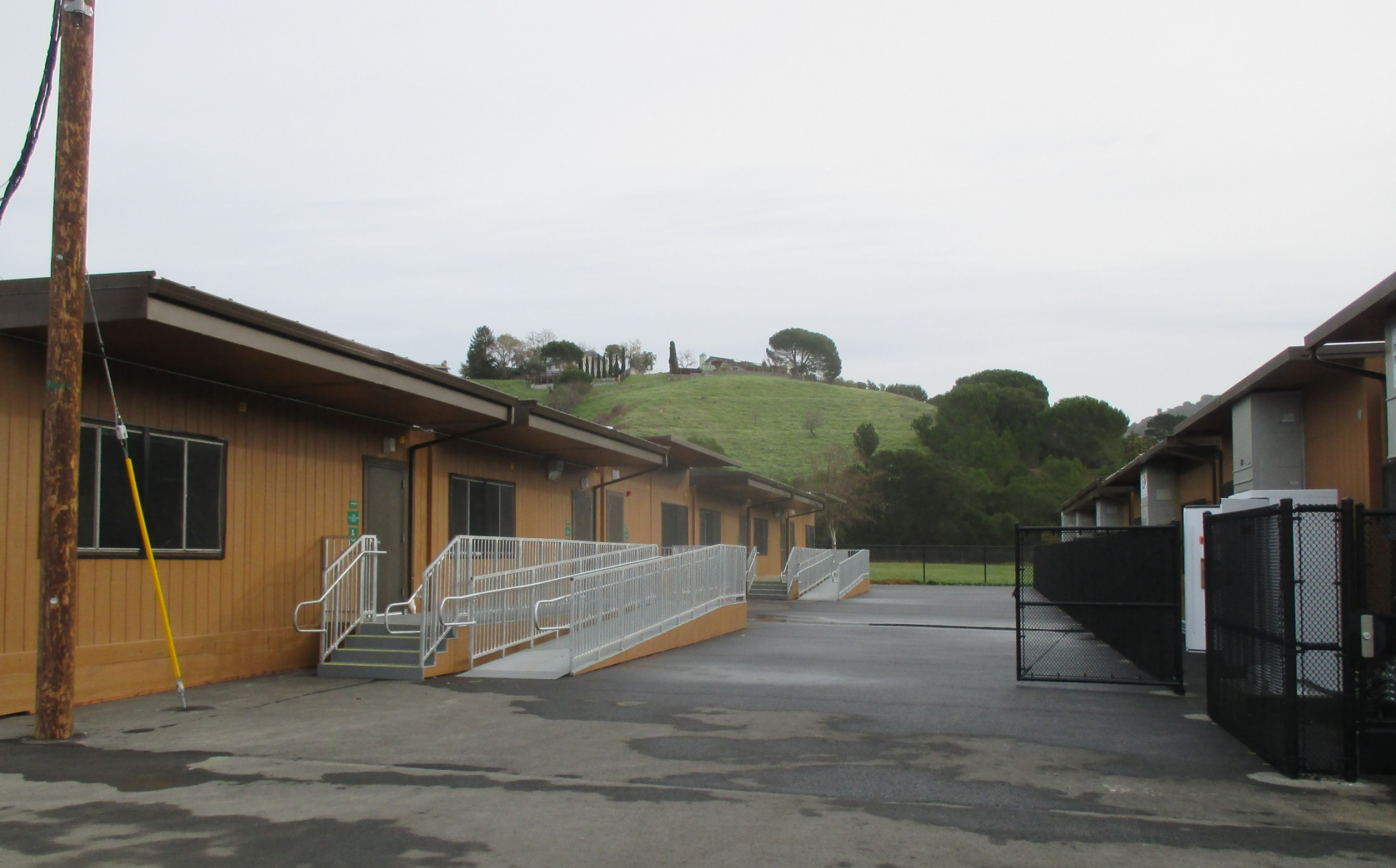
3.b. Valley View Elementary School Interim Campus