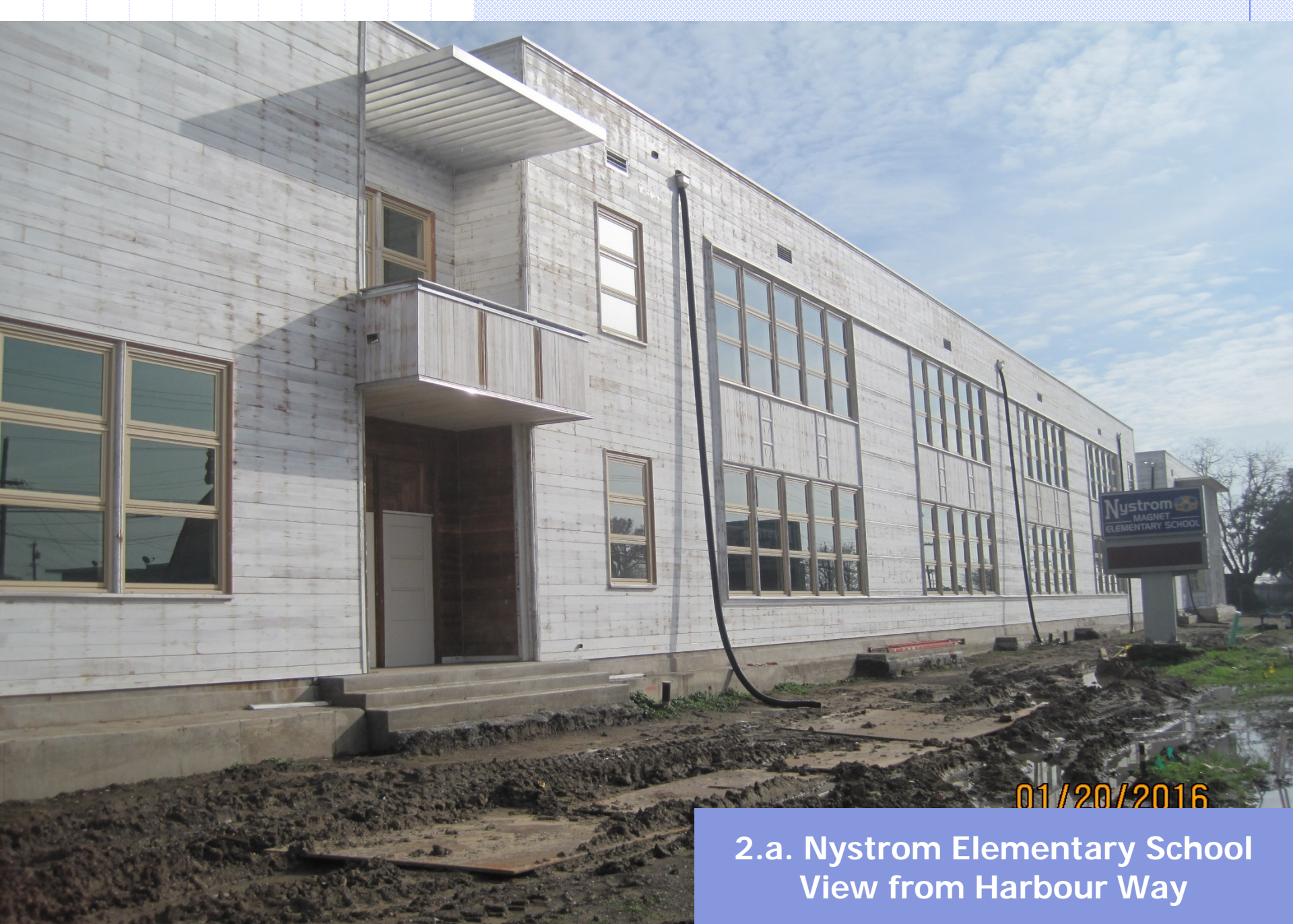
2.a. Nystrom Elementary School View from Harbour Way