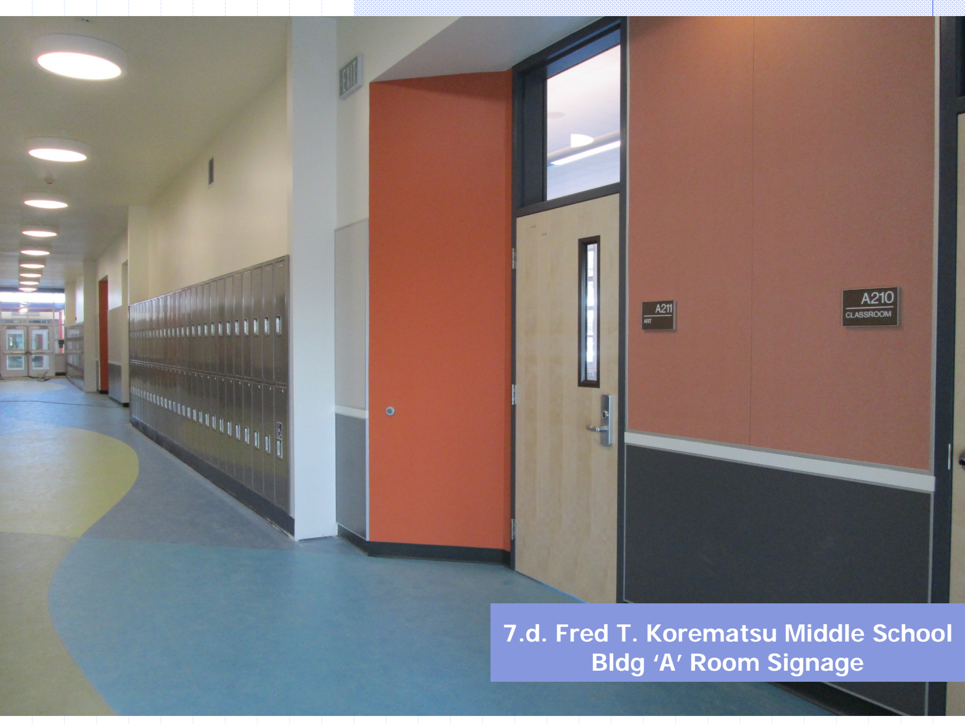
7.d. Fred T. Korematsu Middle School Bldg 'A' Room Signage