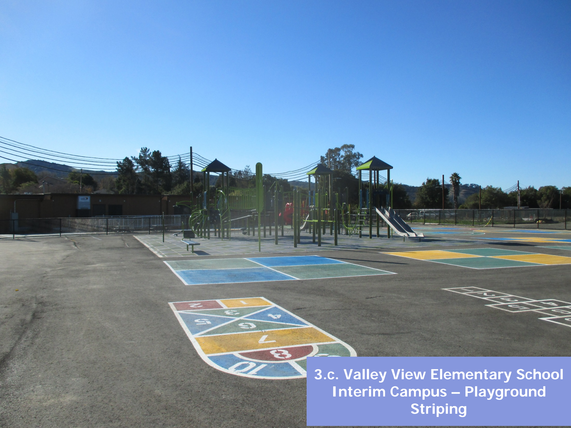
3.c. Valley View Elementary School Interim Campus – Playground Striping