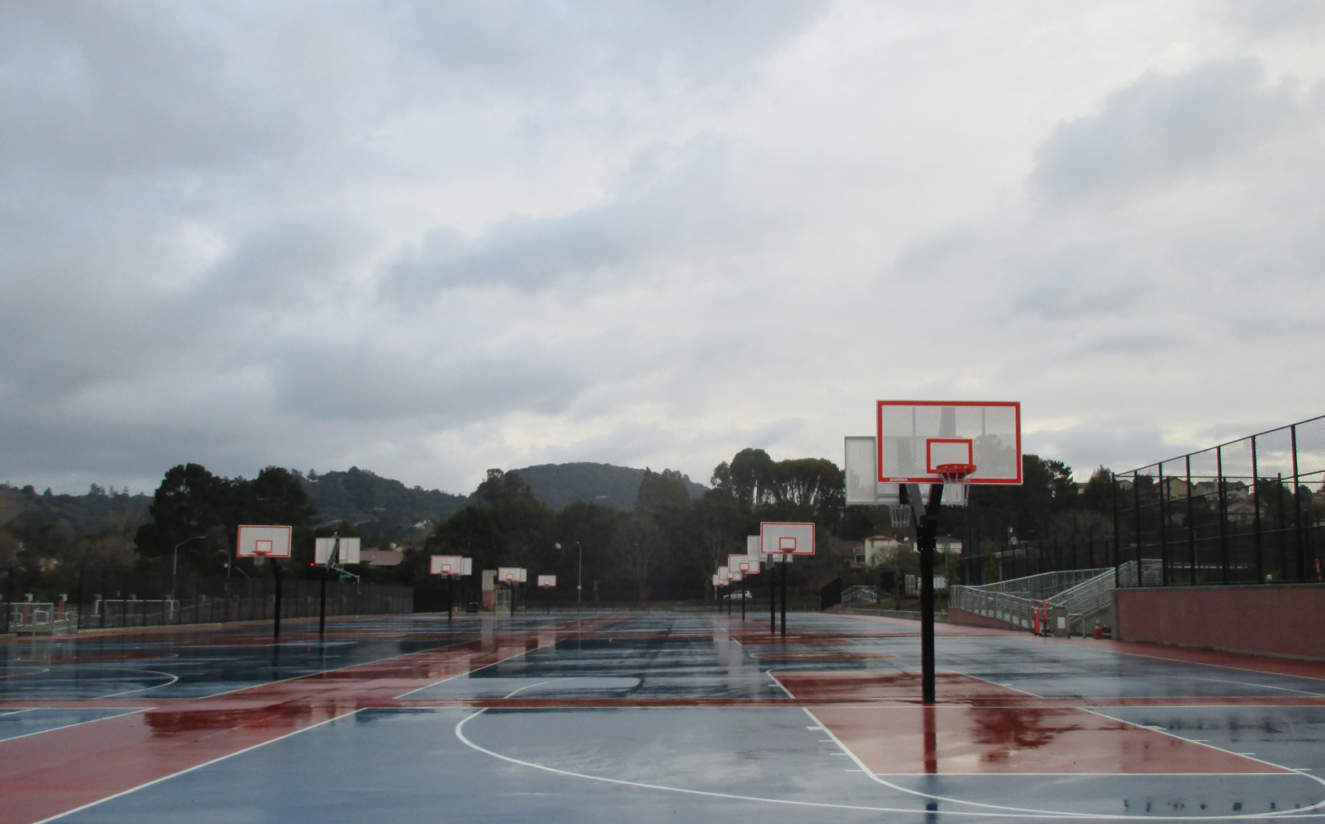
9.f. De Anza High School Linked Learning Building & Athletic Fields Basketball Courts