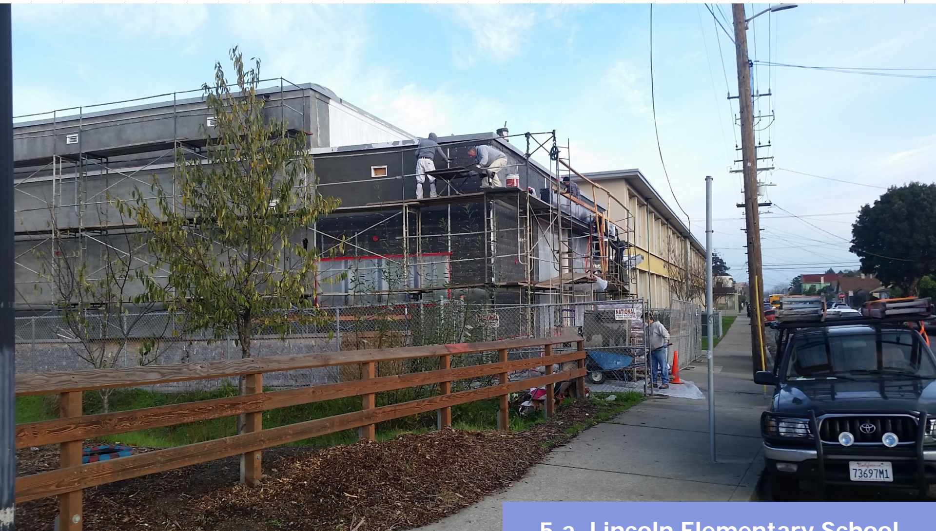
5.a. Lincoln Elementary School Building 'A' Exterior Repairs