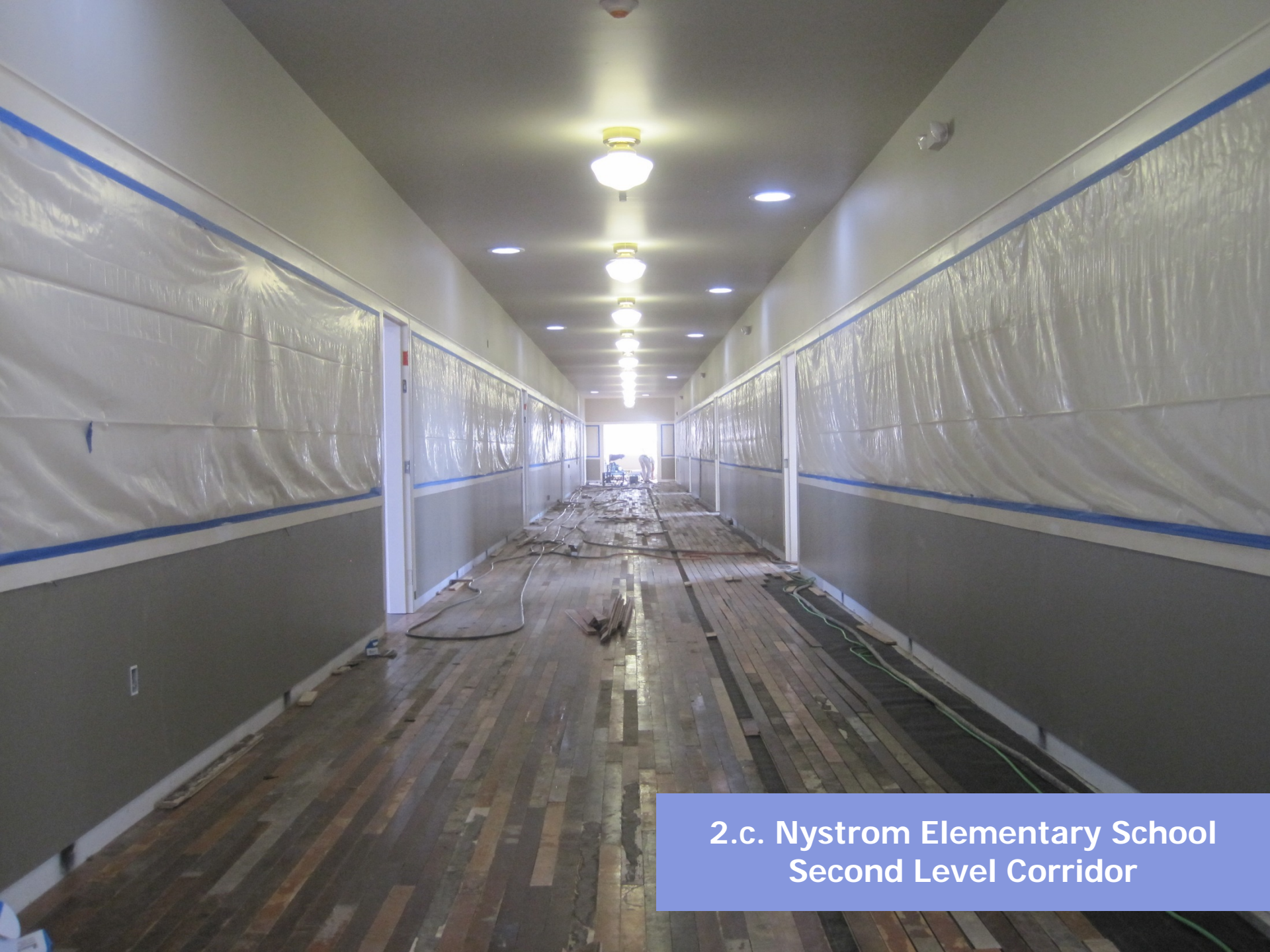
2.c. Nystrom Elementary School Second Level Corridor