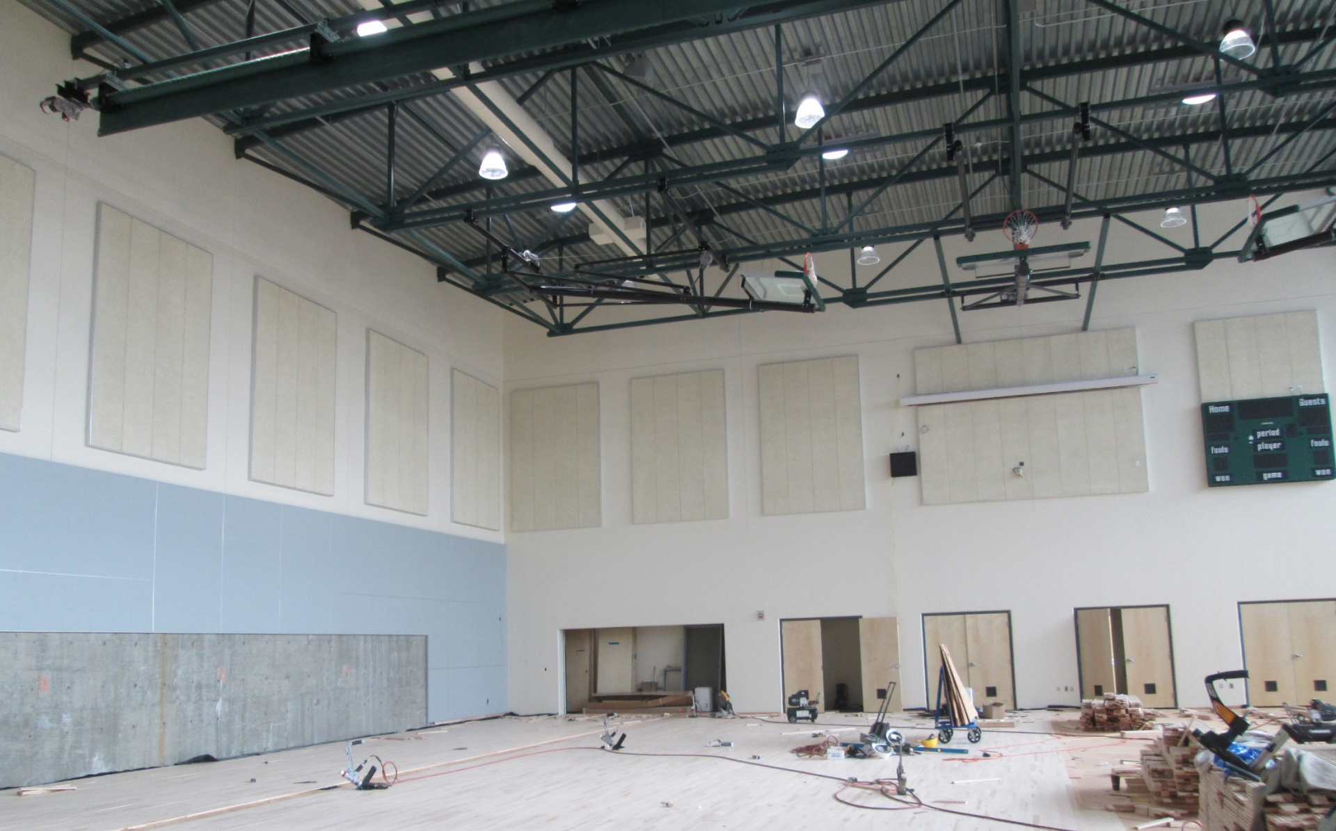
7.f. Fred T. Korematsu Middle School Building 'B' Wood Flooring & Light Fixtures